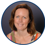
Mrs Small Class Teacher