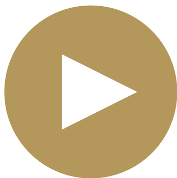
Teatime Concert - January 2023