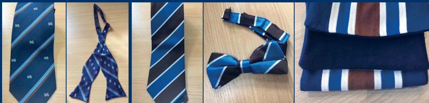
OB Club Tie Silk