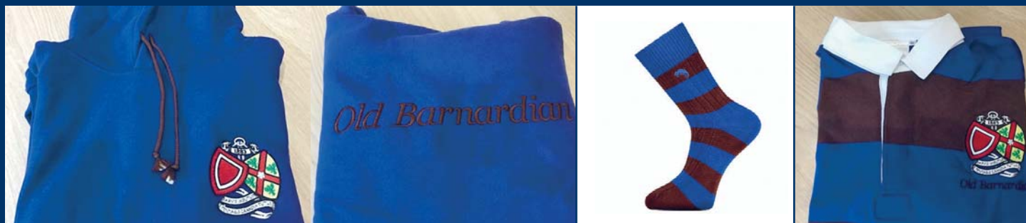
Hoodie (Embroidered front and reverse shown)