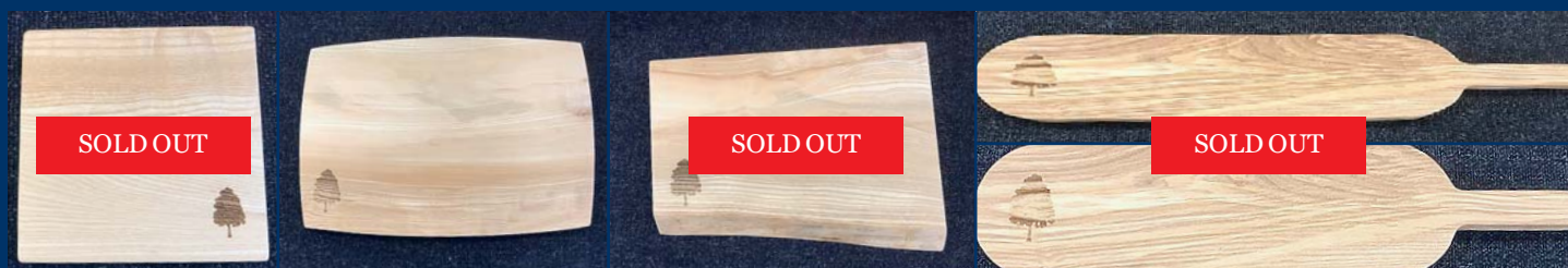
Top Tree Coaster