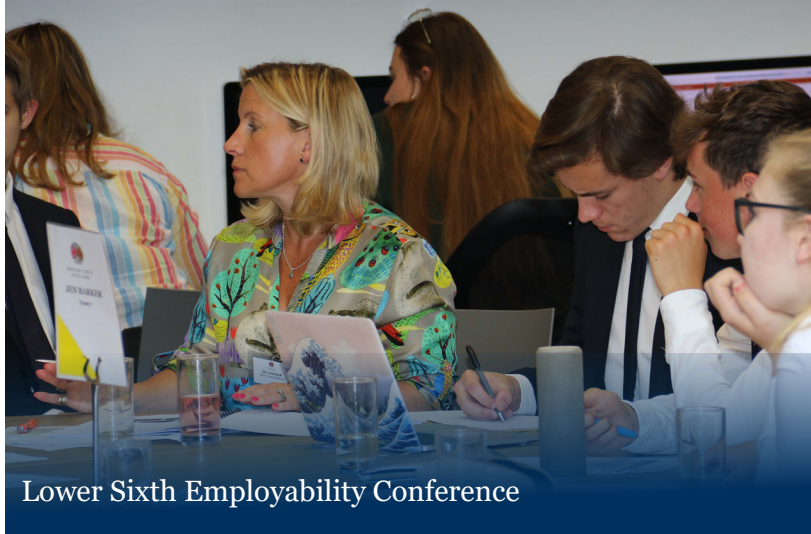
Lower Sixth Employability Conference