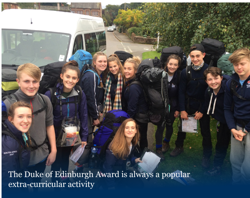
The Duke of Edinburgh Award is always a popular extra-curricular activity